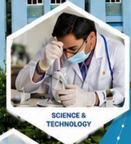
SCIENCE & TECHNOLOGY

A LEGACY OF LEARNING LEADERSHIP & SERVICE