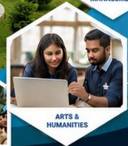
ARTS & HUMANITIES