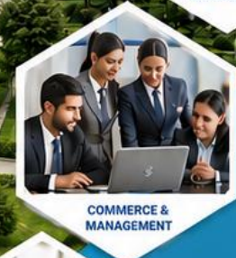
COMMERCE & MANAGEMENT