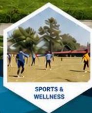
SPORTS & WELLNESS