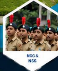
NCC & NSS

MULTIDISCIPLINARY EDUCATION FOR A BETTER TOMORROW