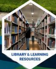
LIBRARY & LEARNING RESOURCES